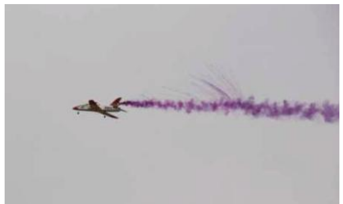
RCD3003 for airplane smoke control